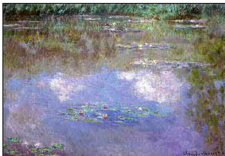
Monet's "Water Lilies - The Clouds," is part of the McDermott Collection at the DMA.