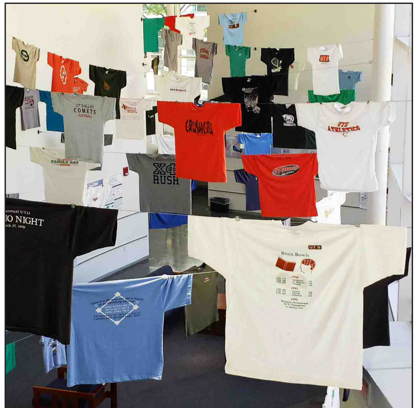
T-shirts hang in the air within the atrium of the Honors building, home of the CV lounge and administrative offices.

The UT Dallas Chapter of Phi Kappa Phi is the local chapter of the nation’s oldest, largest, and most selective collegiate honor society for all academic disciplines. Undergraduate and graduate students are inducted to Phi Kappa Phi each year.